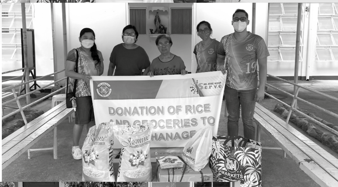
Bahay Kalinga Patag, Sta Maria, Bulacan