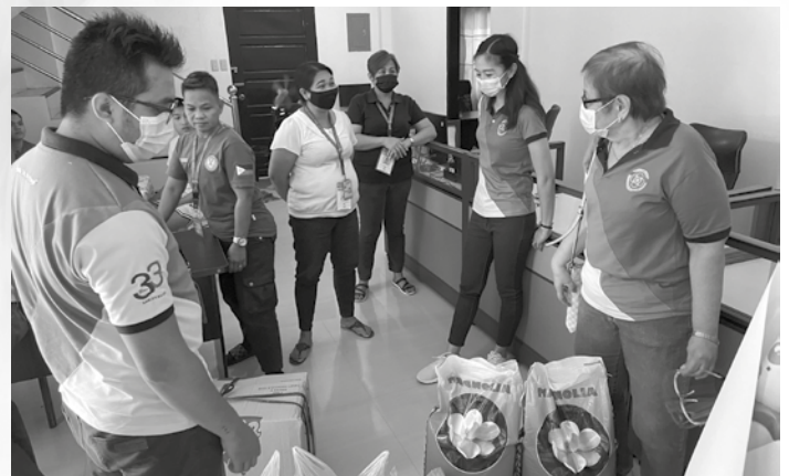
1st Quarter Rice & Grocery Distribution Religious Missionary of Divine Savior & Bahay Pag-asa (February 26, 2021)