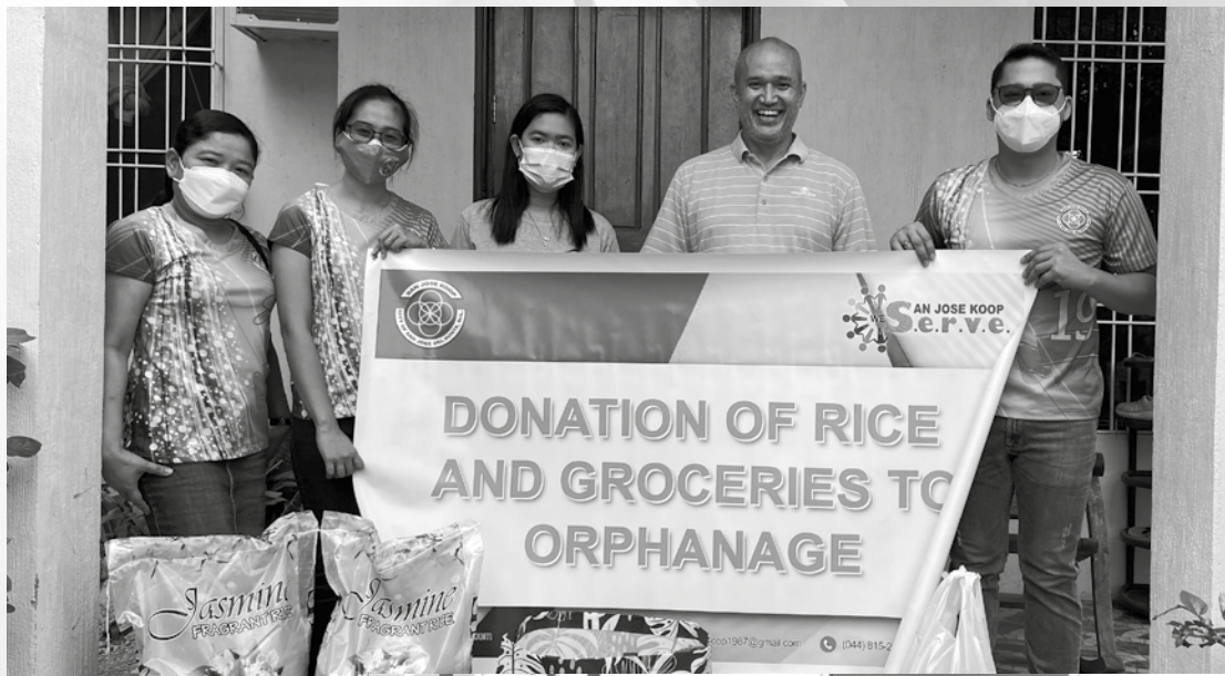
Bahay Sibol Sitio Himpot, Brgy., Dulong Bayan San Jose del Monte, Bulacan