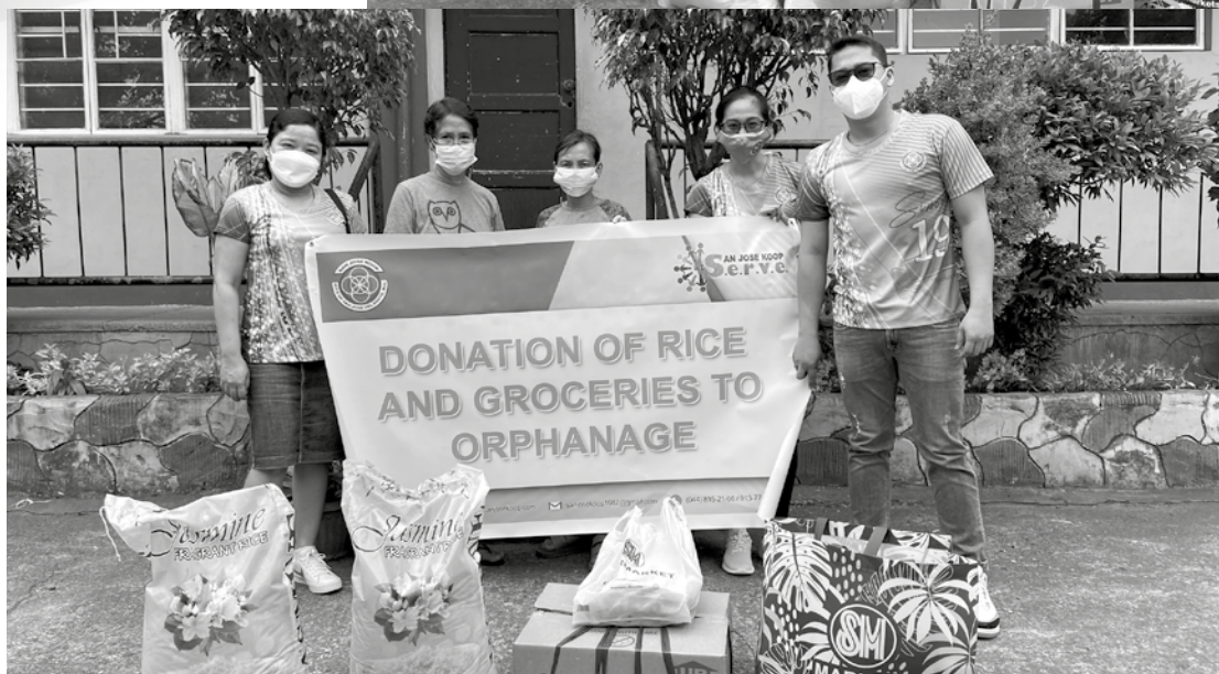
Lingap Bata Patag, Sta Maria, Bulacan